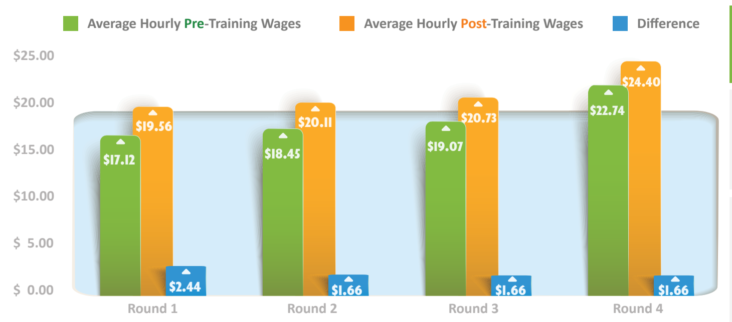
Exhibit 10 Standard WFF Average Pre- and Post-Training Wages per Grant Close-Out Reports (64) by Trainee Classification